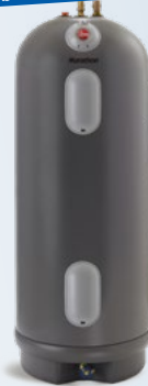
Marathon Lightweight tank that won't corrode