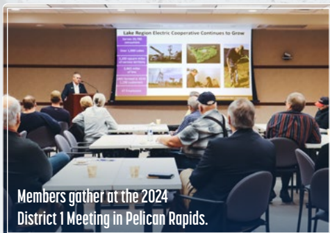
Members gather at the 2024 District 1 Meeting in Pelican Rapids.

At the recent district meetings, I shared a presentation covering member