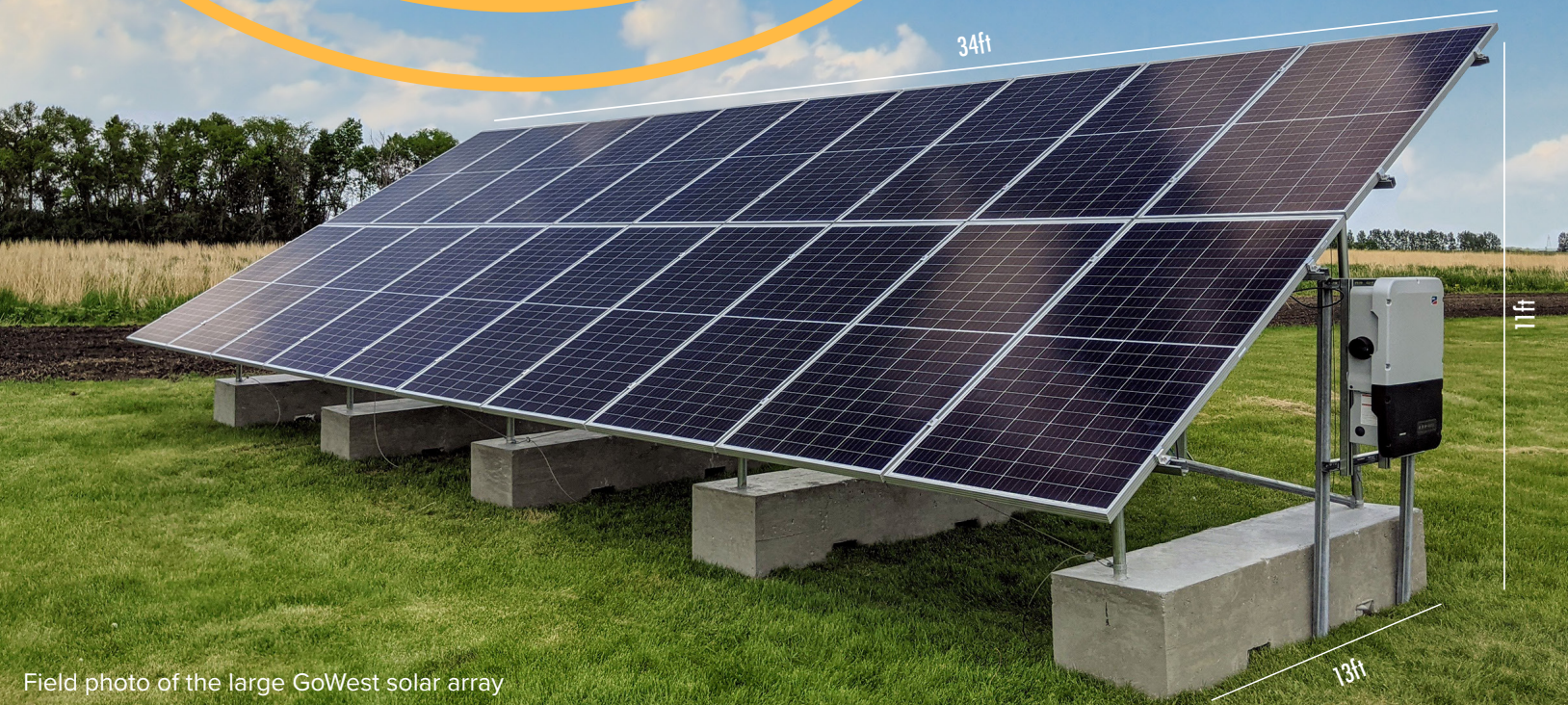
Field photo of the large GoWest solar array

GoWest Solar is a pioneering effort to increase the value of solar energy. The solar array is aligned at 240° to the southwest, optimizing electricity production during summer evenings when electric demand is high and market value is greatest.