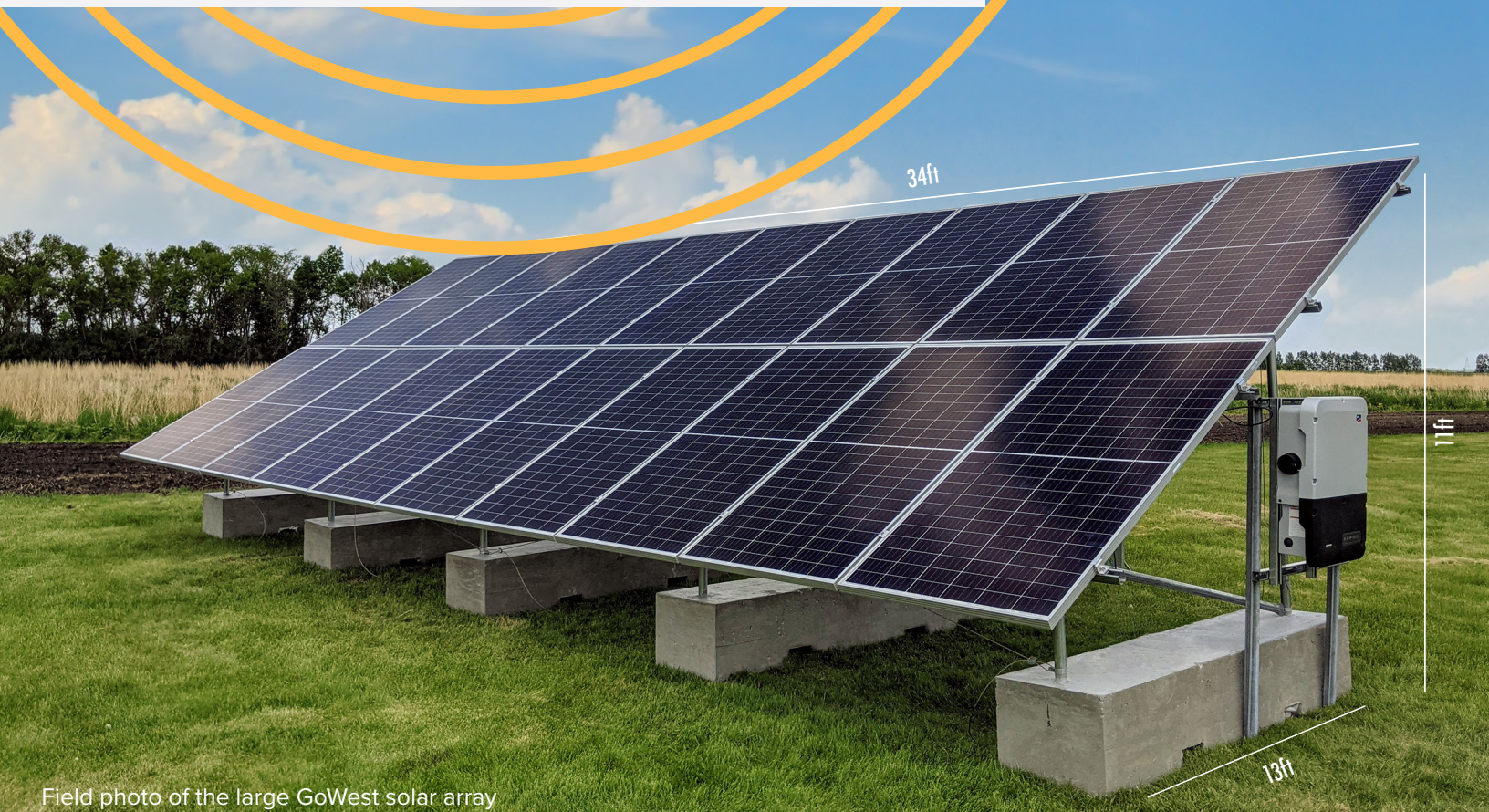
Field photo of the large GoWest solar array

GoWest Solar is a pioneering effort to increase the value of solar energy. The solar array is aligned at 240° to the southwest, optimizing electricity production during summer evenings when electric demand is high and market value is greatest.