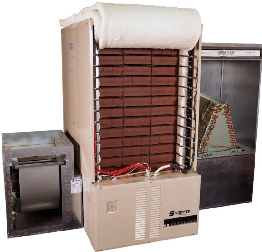
Pictured: Steffes Comfort Plus Forced Air System

LREC will size and price a Steffes system for your needs. Pricing includes delivery to the site where it can be set with a skidsteer.